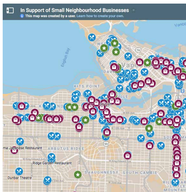
Above Example of our Spring 2020 interactive map & list, showing open neighbourhood businesses during the early pandemic period

Our map was covered in City News 1130: https://www.citynews1130.com/2020/04/09/interactive-map-vancouver-neighbourhood-businesses-operating/