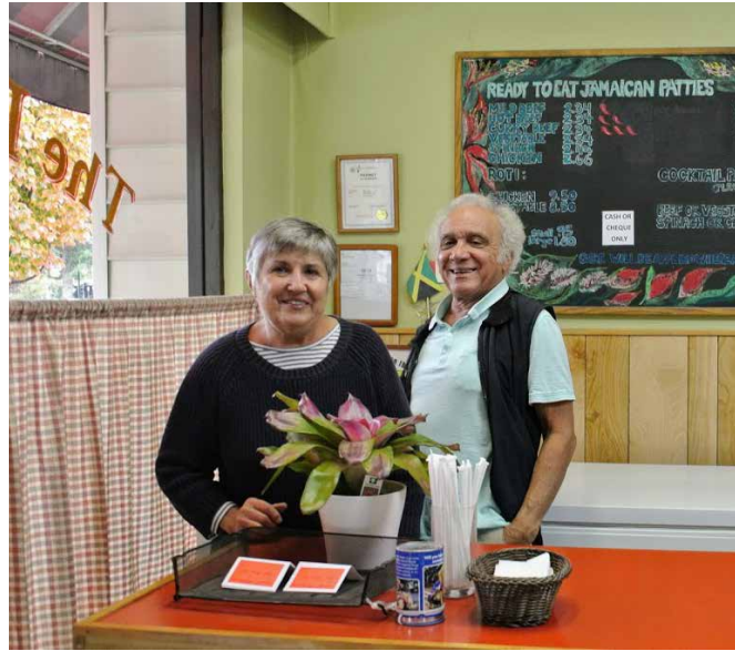
Above Our Living City: The Patty Shop, Arbutus Ridge