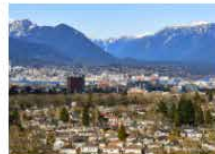
9. Vancouver Plan