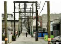
8. Historic Street Elements