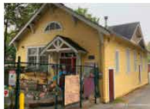
3. Henry Hudson wooden schoolhouse (1912)