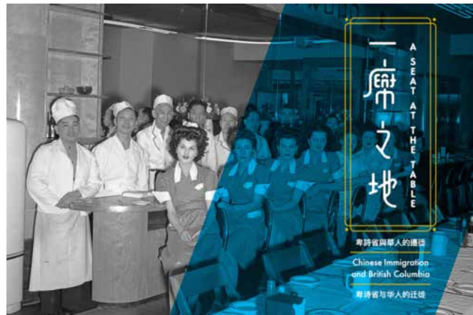
Above A Seat at the Table exhibition. Image MOV

For more information, please visit https://museumofvancouver.ca/a-seat-at-the-table for the exhibition at the Museum of Vancouver and https://museumofvancouver.ca/a-seat-at-the-table-ccm for the sister exhibition in Chinatown.