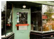
2. Neighbourhood Businesses