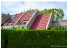
6. False Creek South