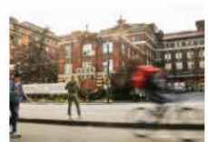
5. St Paul's Hospital – Burrard Building