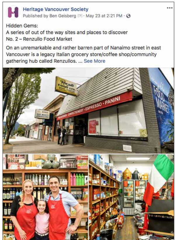
Above Social posting from our Hidden Gems series, this one of the Rezullo Food Market on Nanaimo Street

heritagevancouver.org/resources/past-talk-synopses