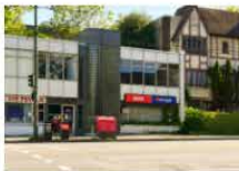
7. Broadway Plan