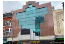
10. Post-modern architecture in Vancouver