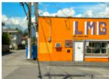
1. Arts and Culture