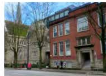
4. Holy Rosary Cathedral Complex